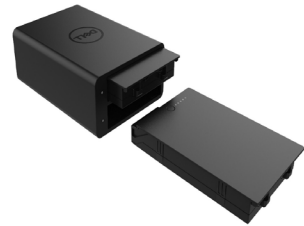
Dell Rugged Battery Charger