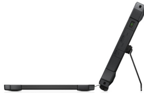
Keyboard Cover with Kickstand