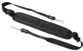
Rugged Shoulder Strap