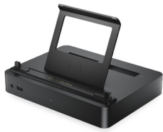
Rugged Tablet Dock