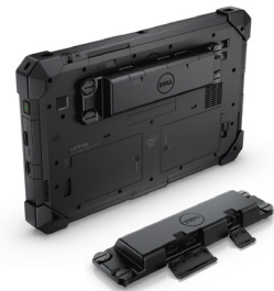
Extended IO Module