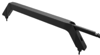
Dell Rugged Extreme Handle